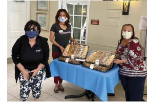
Delivering desserts at Palm Garden of Pinellas and pizza at Palm Garden of Largo

facilities. We have also built personal and professional relationships with these devoted healthcare professionals. As a thank you, we have been providing pizza, platters, drinks and more to these dedicated individuals—all at a safe distance of course. Frankly, we also miss them and want them to know we are thinking of them.